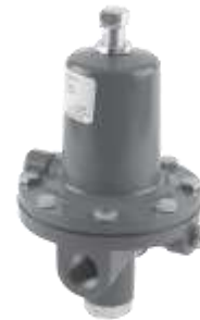
67C SERIES REGULATORS