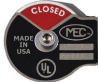
Check Valve Indicator "CLOSED"